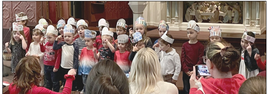
Photos from our Veterans day program more photos on next page.