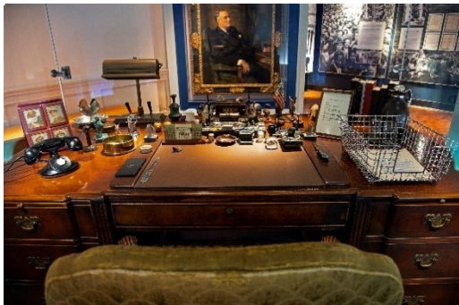
FDR Desk at Hyde Park, New York