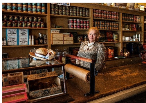
Greenfield Village - Dearborn, MI