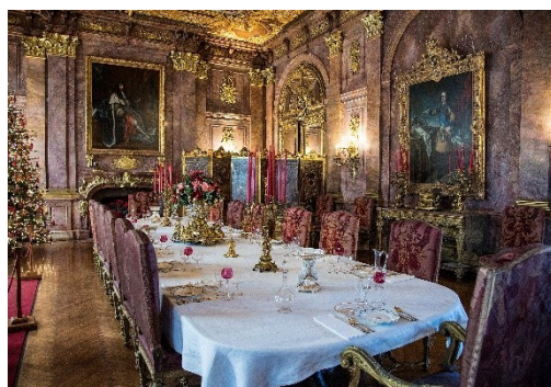
Marble House - Newport, RI