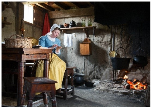
Plymouth Plantation - RI