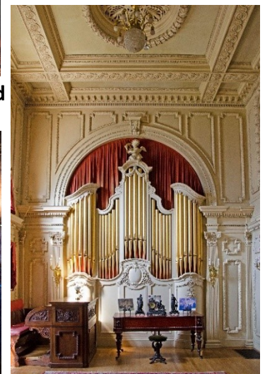
Beleden Mansion - Bristol

Join us! We meet on the First Tuesday of every month except July and August at 7:00pm in the Parish Center.