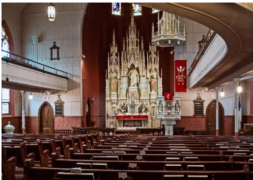
Immanuel Lutheran Church

Indoor opportunities are endless! You'll find history, art, emotion, and memories challenging your photography skills. It's the difference between standing in front of FDR's Mansion at Hyde Park or going Behind the Bricks , sitting at his desk, touching it, and seeing what he saw, then trying to convey this experience to your audience. Indoor Photography? It's worth a try!