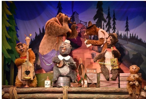
Country Bear Jamboree - Disney World