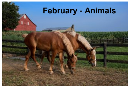
February - Animals