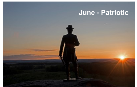
June - Patriotic

Join us! Our next meeting is, Tuesday, September 3, at 7:00pm in the Parish Center.