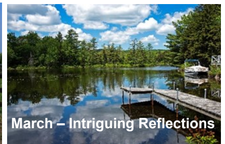
March – Intriguing Reflections