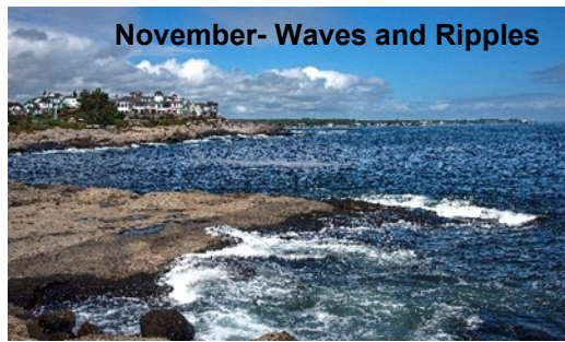
November- Waves and Ripples