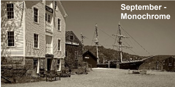
September - Monochrome

New Year's Day for the Photo Club is September 3. With it comes the 2024-2025 Photo Club Assignments or Topics for the next 10 months.