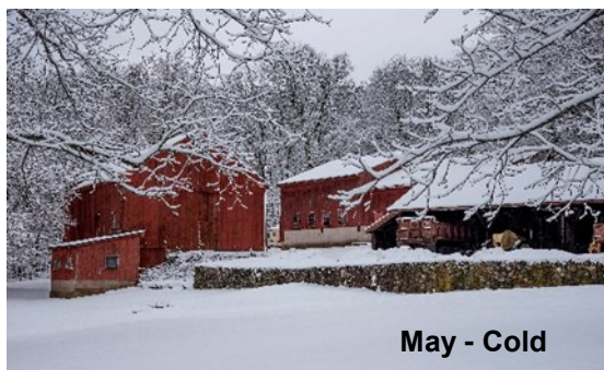
May - Cold