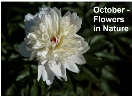
October - Flowers in Nature