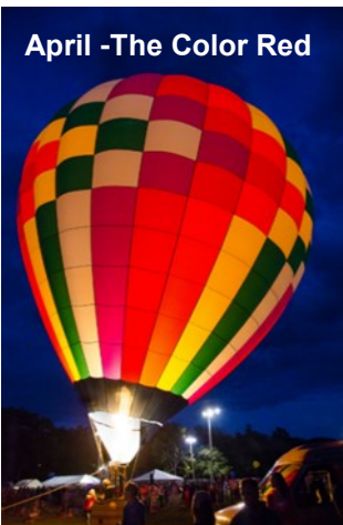
April -The Color Red