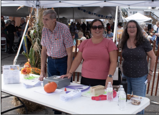
German Festival