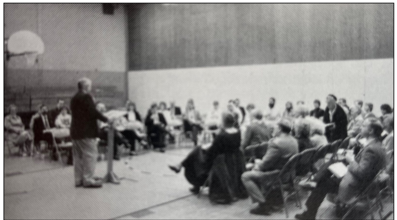
Funeral reception on Saturday, September 28